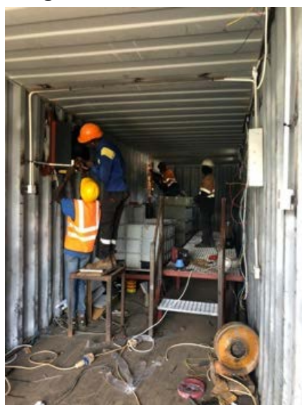
On site Workshops