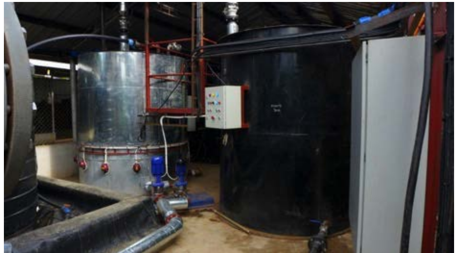
Heating Elements for Eluant Tank