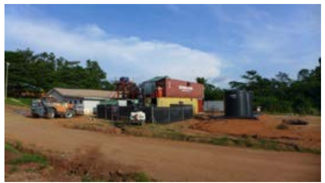
Site Under Commission