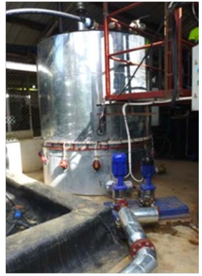
Elution and Electric Panel