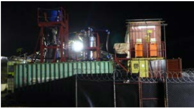
Rectifiers being commissioned