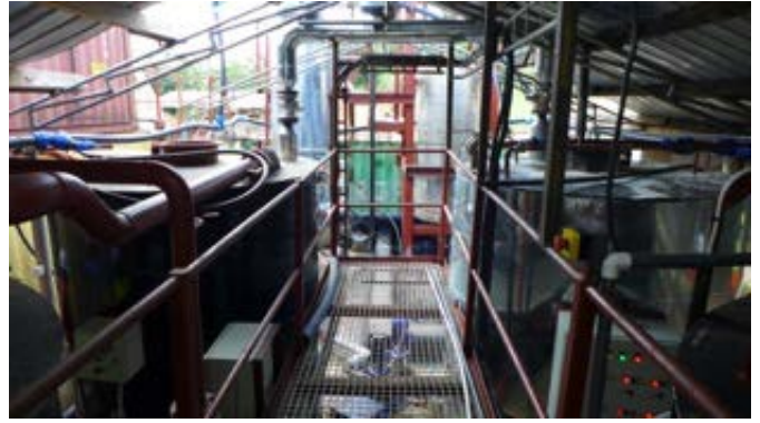
walkway between eluant tank and caustic tanks