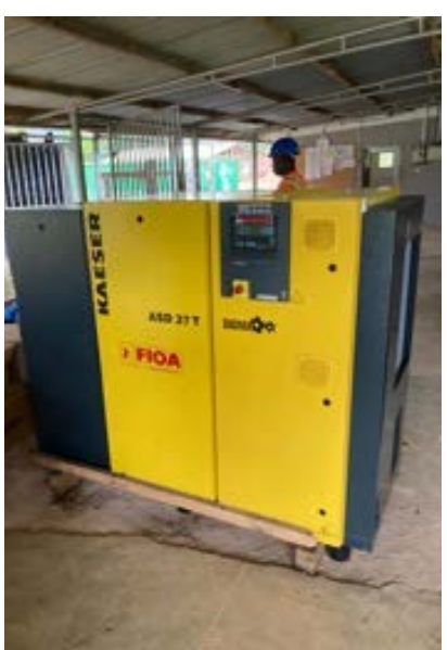
Installation of Elution and Acid Wash Columns and Eluate tanks and Compressor