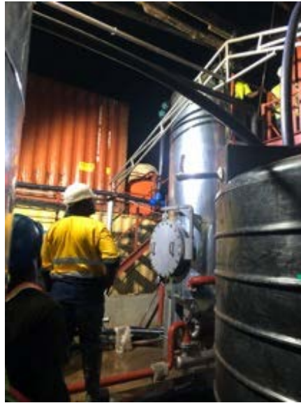
Monitoring the engineering