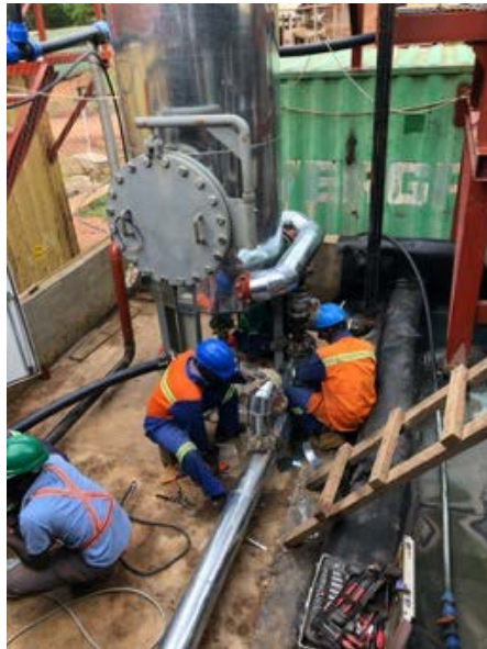
Elution Column being insulated