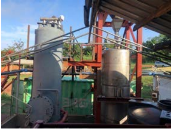
Elution and Acid Wash Columns and the workers