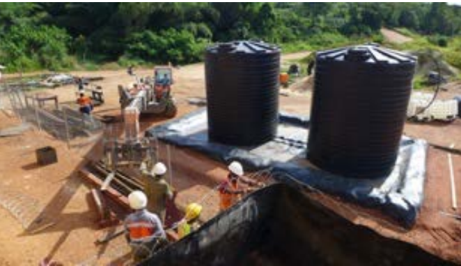
Effluent tanks in bund