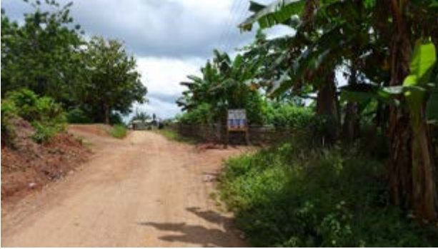
Entrance to the Akrokeri Ashanti North Shaft