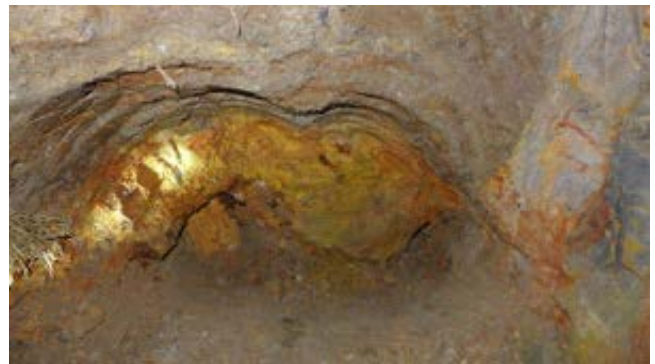
Exploring the Galamsey level