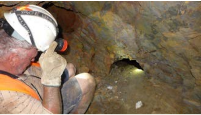
Looking towards Aki's Shaft

Reviewing the Galamsey workings – next level through hole