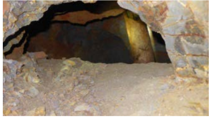
Looking into Galamsey workings