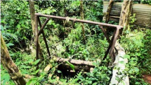
Galamsey (Rashid) Shaft that accesses workings