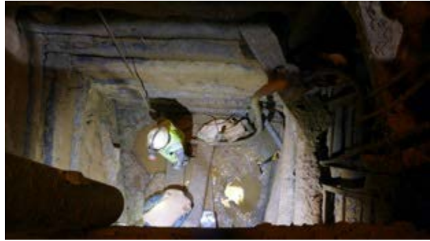
Tools and old Wood supports retrieved from North Shaft