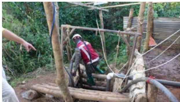
Galamsey Shaft Timber Supports