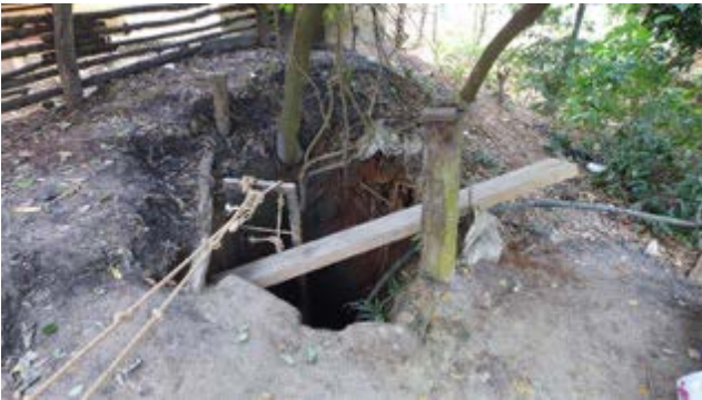
Looking up Aki's Shaft