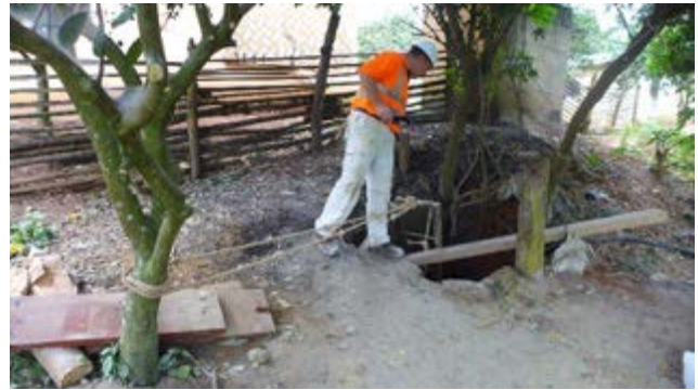
"halo" the ore body the Galamsey mine