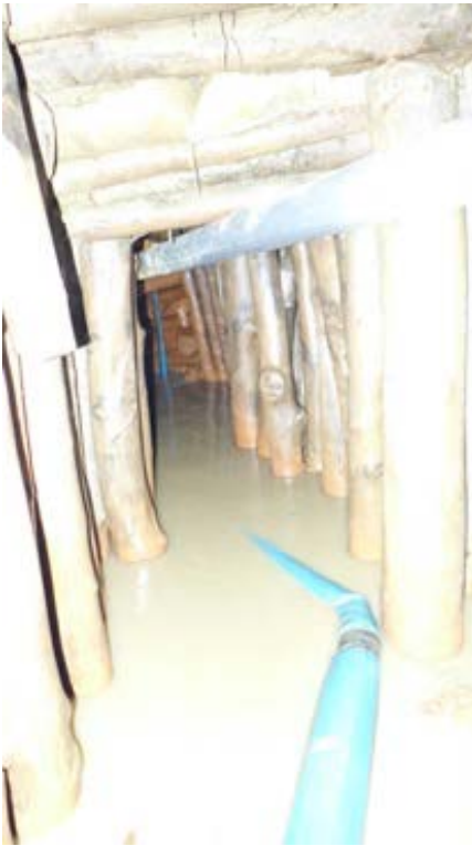
Along the level