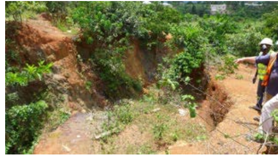
Carrying out Inspection